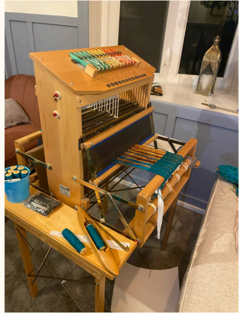
Jacqueline's new 12-harness loom and designing a pattern for Chicago.