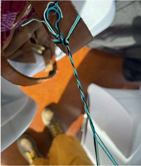
Janet's three strand finger woven loop braid.